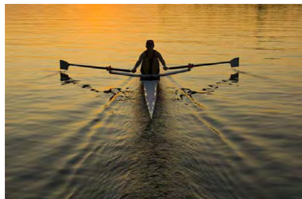
Figure 2 – Single scull

A quad scull, or quadruple scull in full, is a rowing boat. It is designed for four man power persons who propel the boat by sculling with two oars, one in each hand. So one quad = four men = 1/3 h.p. = 248 watts in old definition. But the speeds achieved by a quad scull are 10 to 11 knots! Suddenly paddle power is looking good.