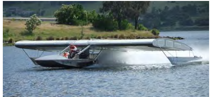
Figure 7 – Paddle wing in full flight, 35 knots.

The overall propulsive efficiency at 35 knots is 47%, based on developing the full engine power of 150kW and a predicted resistance of a 3.2 tonne skiff of 4 kN at 35 knots.