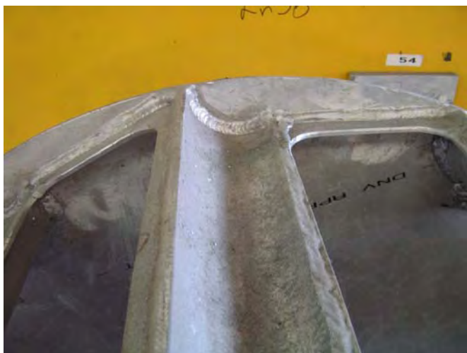
Figure 6 – Curved blade detail.

The flat profile blades were then re-fitted and the skiff grew “wings”.