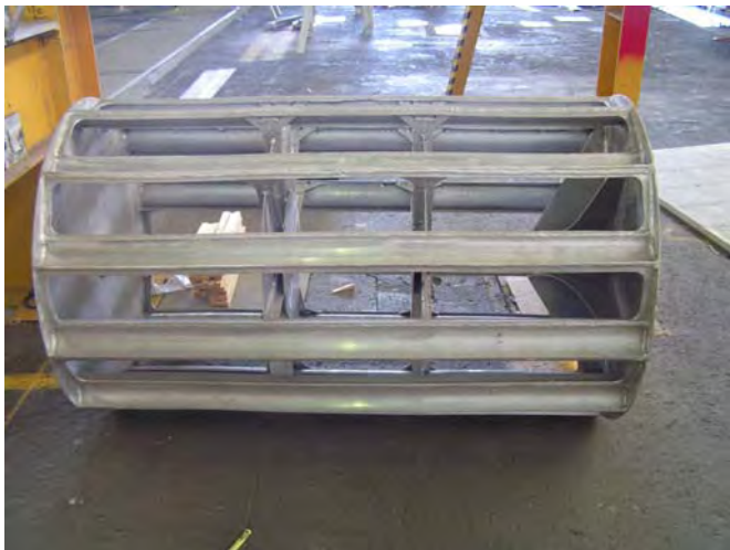
Figure 5 – Curved blade paddle wheel, 12 blades.

A curved blade paddle profile was substituted in an attempt to alleviate the tendency to “carry” discharge water around with the paddle blades at higher speeds and thus convert this into additional thrust. The additional thrust occurred at lower speeds, but it caused a strong upward thrust component from the paddle. This resulted in excessive bow trim to the vessel and an inability to achieve higher speeds.