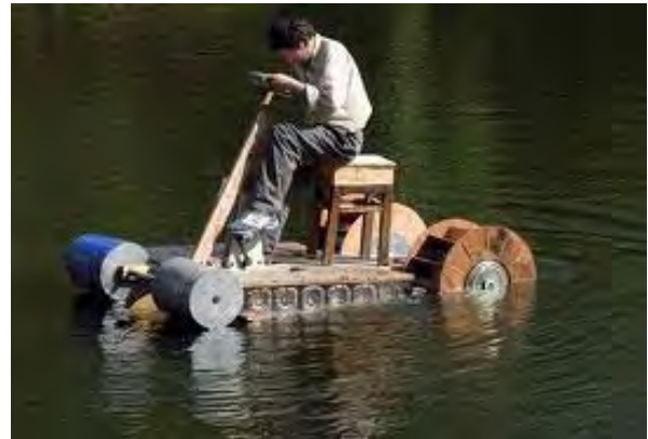
Figure 1- Healthy Man?

It corresponds fairly exactly to the amount of power a healthy man can exert over a period of a few hours - like our man in Figure 1.