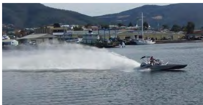
Figure 4 – Trials with flat blade paddle wheel, 32 knots.

Compare this to a small fibreglass outboard powered runabout which achieves around 50% propulsive efficiency and we have some confidence that we’re getting close.