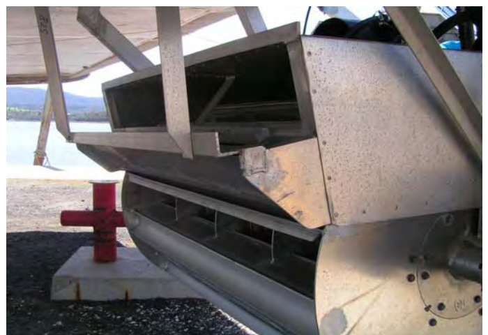
Figure 8 – Curved blade mk2, 10 blades with fairings.

In addition, they were to provide structural support to stiffen the blades longitudinally and hopefully prevent cracking which was occurring at the blade roots. The blade root cracking was evident after repeated trials on the flat paddle wheel, and also occurred on the curved blade paddle wheel after just a few trials.